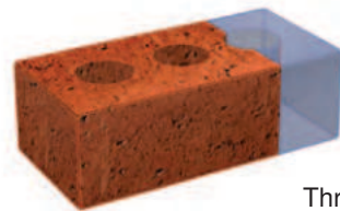
Three quarter bat