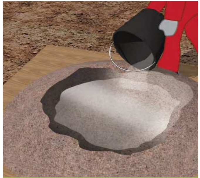
8.16 - A dam is formed and the water is poured into the centre.