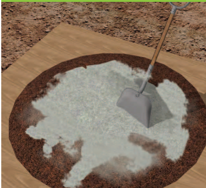
8.14 - Spread the cement over the mixture.