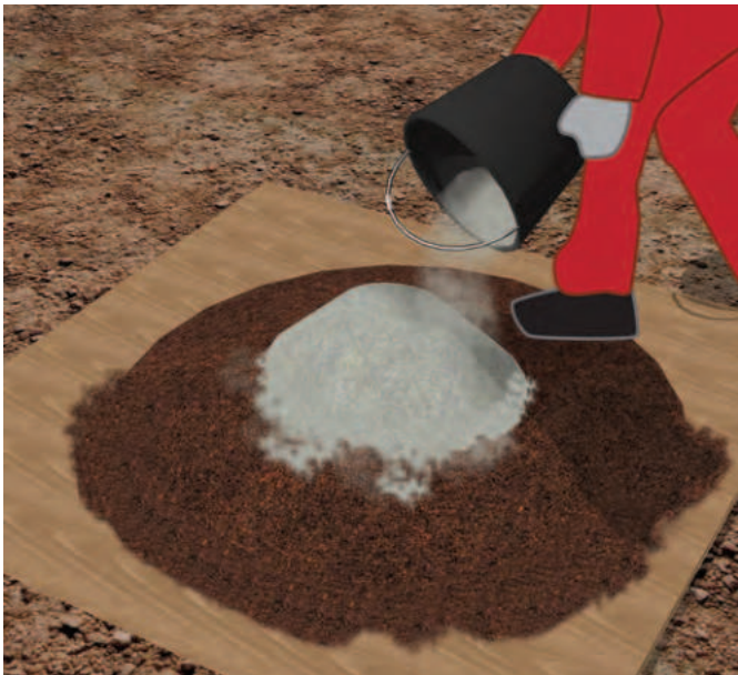
8.13 - The bucket of cement is emptied on top of the six buckets of sand and the bucket of lime.