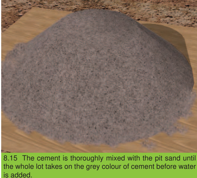
8.15 The cement is thoroughly mixed with the pit sand until the whole lot takes on the grey colour of cement before water is added.