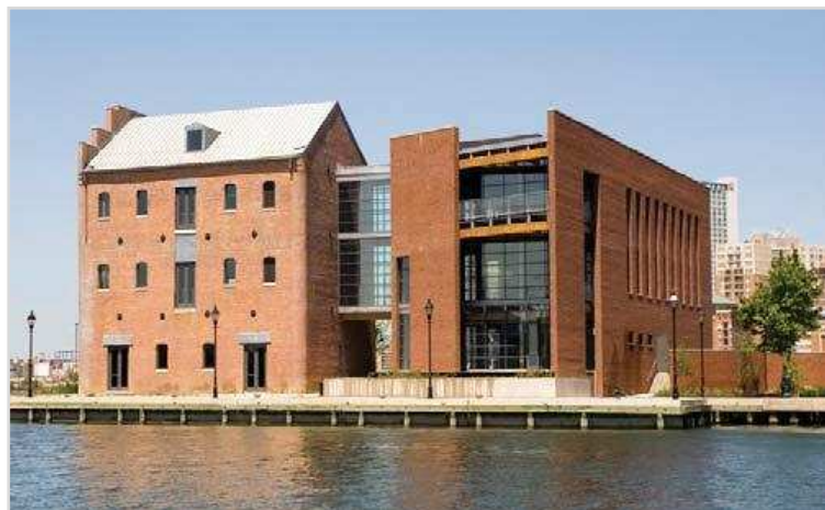
Figure 1 Reused brick is combined with New Brick in this extended commercial building.

The benefits of thermal mass have been demonstrated when brick is used as a veneer, and are even more pronounced when brick masonry also is exposed on the interior of the building.