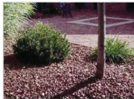
Figure 2 Scrap brick and brick from demolition can be crushed as brick chips for landscaping

Brick also can be reused. Individual brick units can be salvaged and reused with proper precaution. Sand-set brick pavers are the easiest to reuse because they are easily removed and typically remain physically unaltered. Mortared units, pavers and facing units must be carefully cleaned of old mortar before reuse.