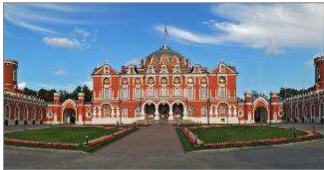
Figure 7: Petrovsky Road Palace in Moscow was built for Tsarina Catherine II, and was a home to her son Emperor Paul I.

The Great Wall of China protected half of Asia from the Mongolian invaders, and many of the world's most beautiful heritage buildings show off clay brick exteriors.