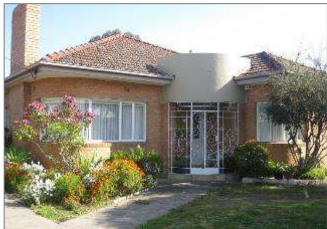
Figure 5: 1960's mine home on the Witwatersrand