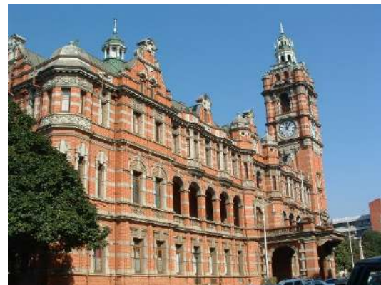
Figure 3: Pietermaritzburg City Hall, South Africa largest all-brick building was completed in 1902.