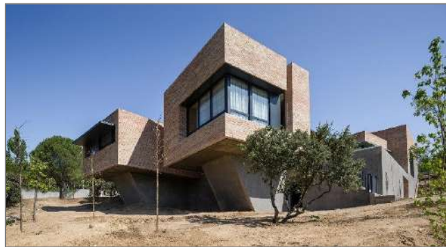
Figure 8: Clay brick is being used in the latest contemporary homes.

The Clay Brick Association of South Africa Website: www.claybrick.org