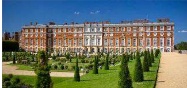
Figure 6: Hampton Court, England. The 500 year old palace of King Henry VIII

If you have a red brick home - be proud of it! You are in illustrious company. King Henry the 8th lived in a home of red clay brick - the world renowned Hampton Court Palace. His descendants, Queen Elizabeth and Prince Charles have clay brick homes today.