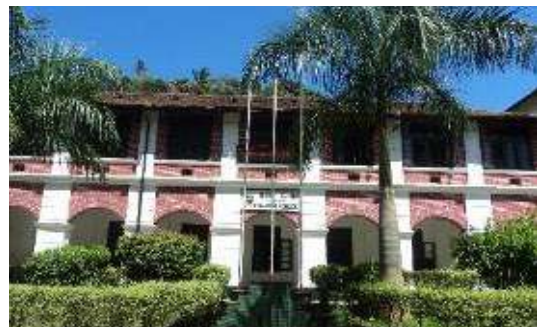
Figure 2 : Prestigious Kingswood College in Grahamstown is was built in 1894.