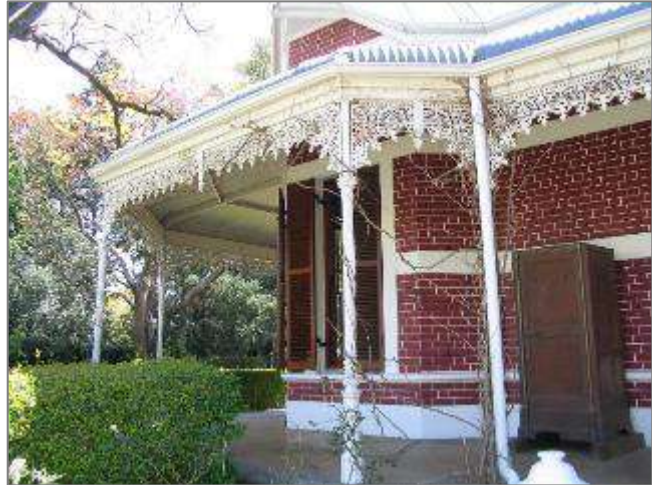
Figure 4: An early settler's Cape Dutch home, dating to the early 1700's.

Brick homes kept suburbs quiet in the days of Johannesburg's mining past when half the population worked 24 hour shifts to keep the wheels of our economy turning.